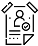
CWO poster with up-to-date contact details

There is a lot of information to share with parents, coaches and players. One way to do this is through the use of a noticeboard (or a virtual noticeboard). Examples of information that should be shared: