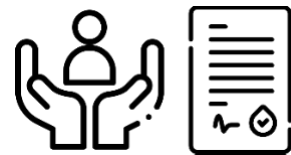
Child Safeguarding Statement