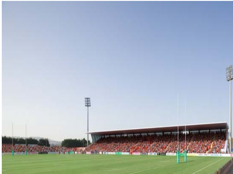
Looking into the future, an image of the proposed Musgrave Park Stand

As part of Munster's long term plan to develop training and playing facilities within the province, planning permission was sought and granted for a new West Stand in Musgrave Park, to include team and administration facilities.