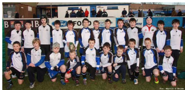
The Constitution Minis squad for the blitz

It was the first time the teams played under lights, great fun for all involved playing in new conditions and all reported the experience was great and something to remember.