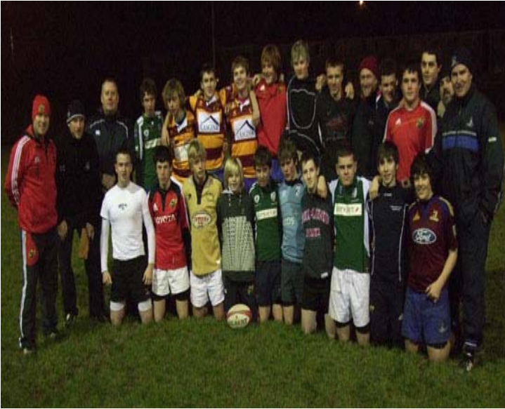
Cork Constitution Under 17 squad who participated in the Munster Rugby Coaching Work Shop

The Club's U17 squad participated in the practical element of the workshop 'Developing Individual Skills with an emphasis on General Movement'. The module highlighted the benefits of coaching in the collective focusing on the general movement philosophy.